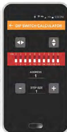
DIP Switch Calculator