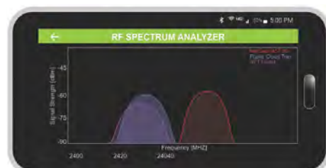
RF Spectrum Analyzer (Android only)