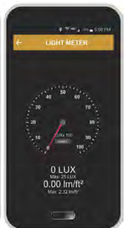
Light Meter (Android only)